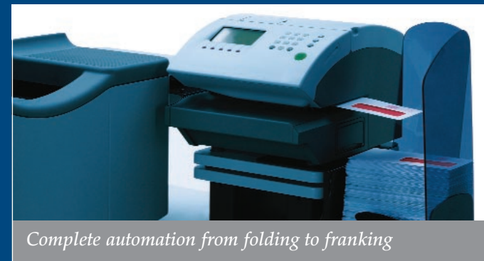
Complete automation from folding to franking