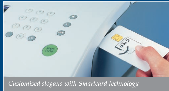
Customised slogans with Smartcard technology