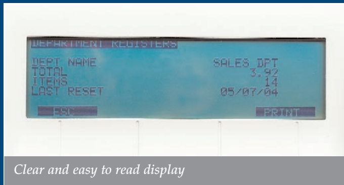
Clear and easy to read display